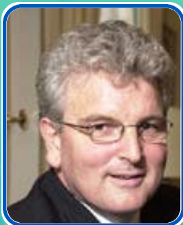
Rt Hon Des Browne MP Chief Secretary to the Treasury KEYNOTE SPEAKER

A ONE DAY CONFERENCE TUESDAY 28TH JUNE 2005, CARLTON HOTEL, NORTH BRIDGE, EDINBURGH