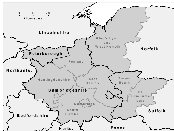
Map 2 – Map of Local Authority Areas involved in the Cambridge Sub-Region Traveller Needs Assessment (South-East England)